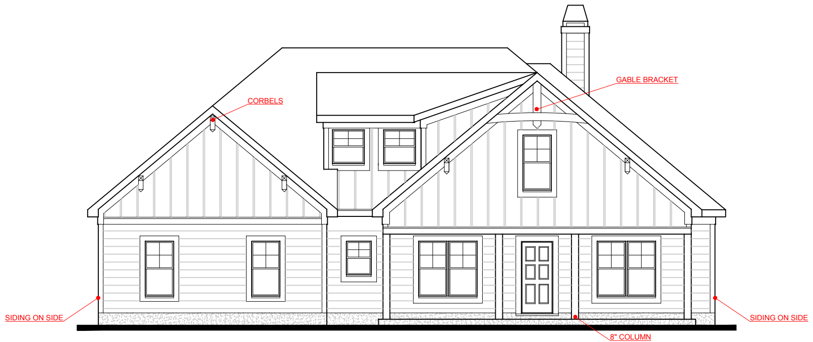
FRONT ELEVATION- A VERSION