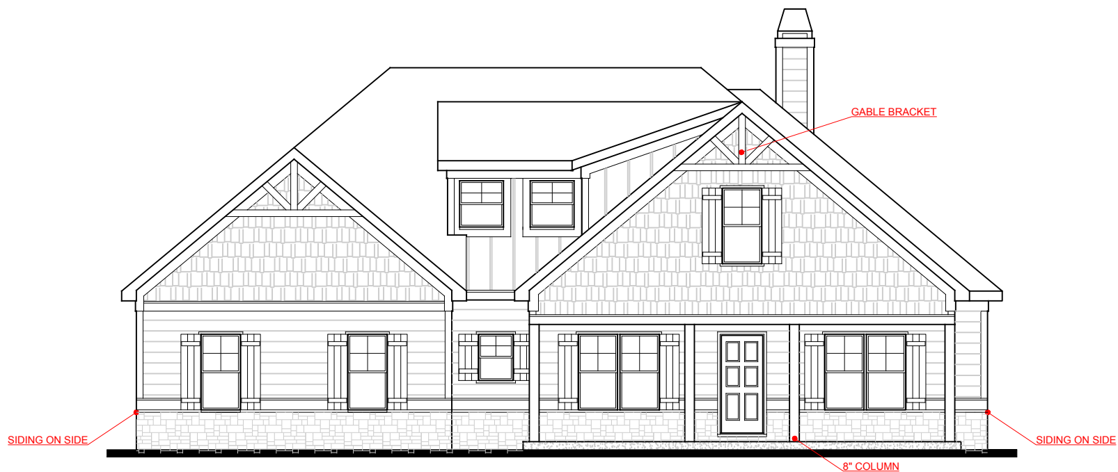
FRONT ELEVATION- B VERSION