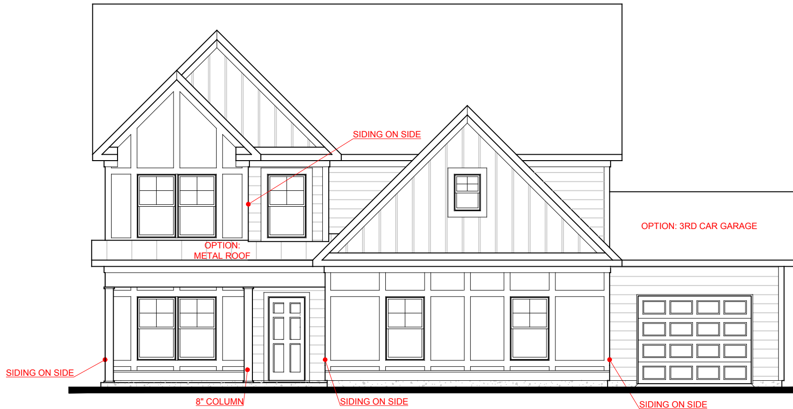
FRONT ELEVATION- A VERSION