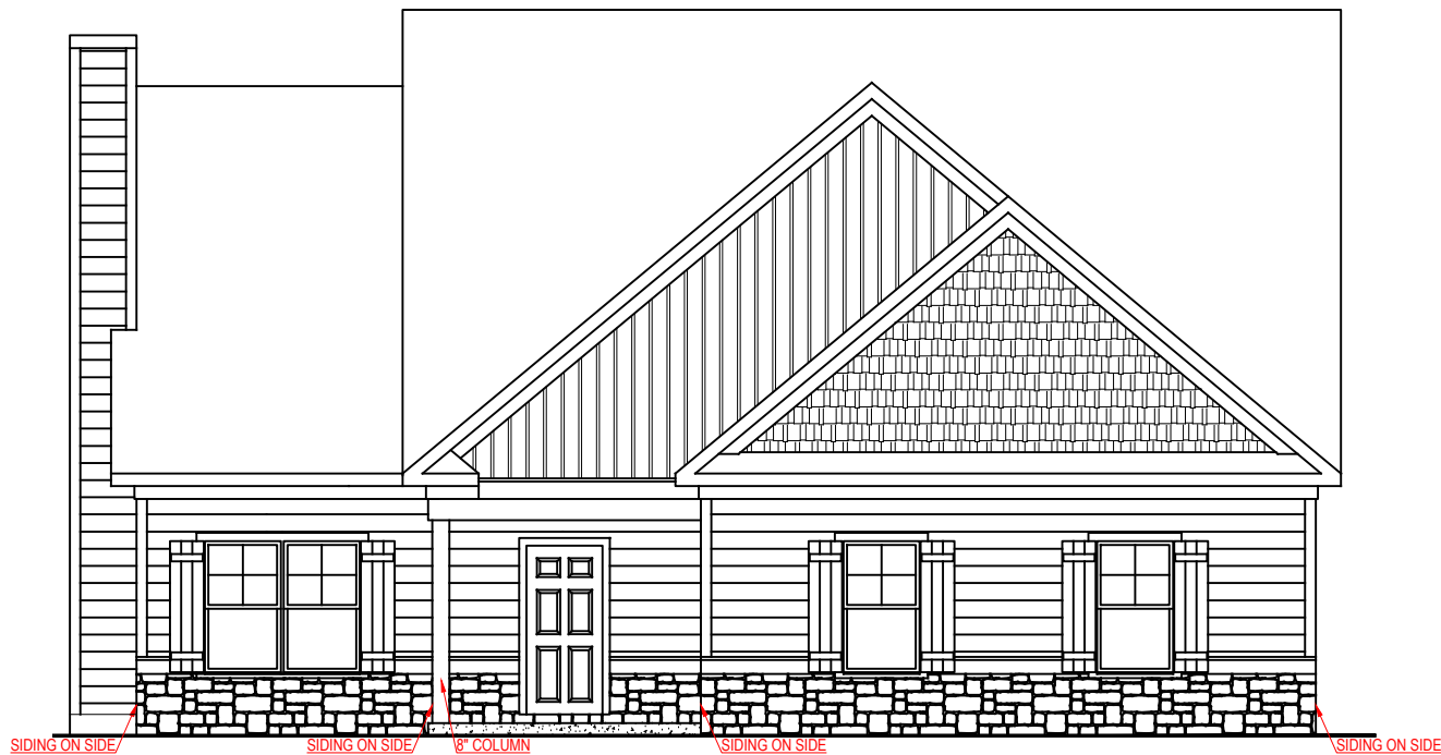
FRONT ELEVATION - B VERSION