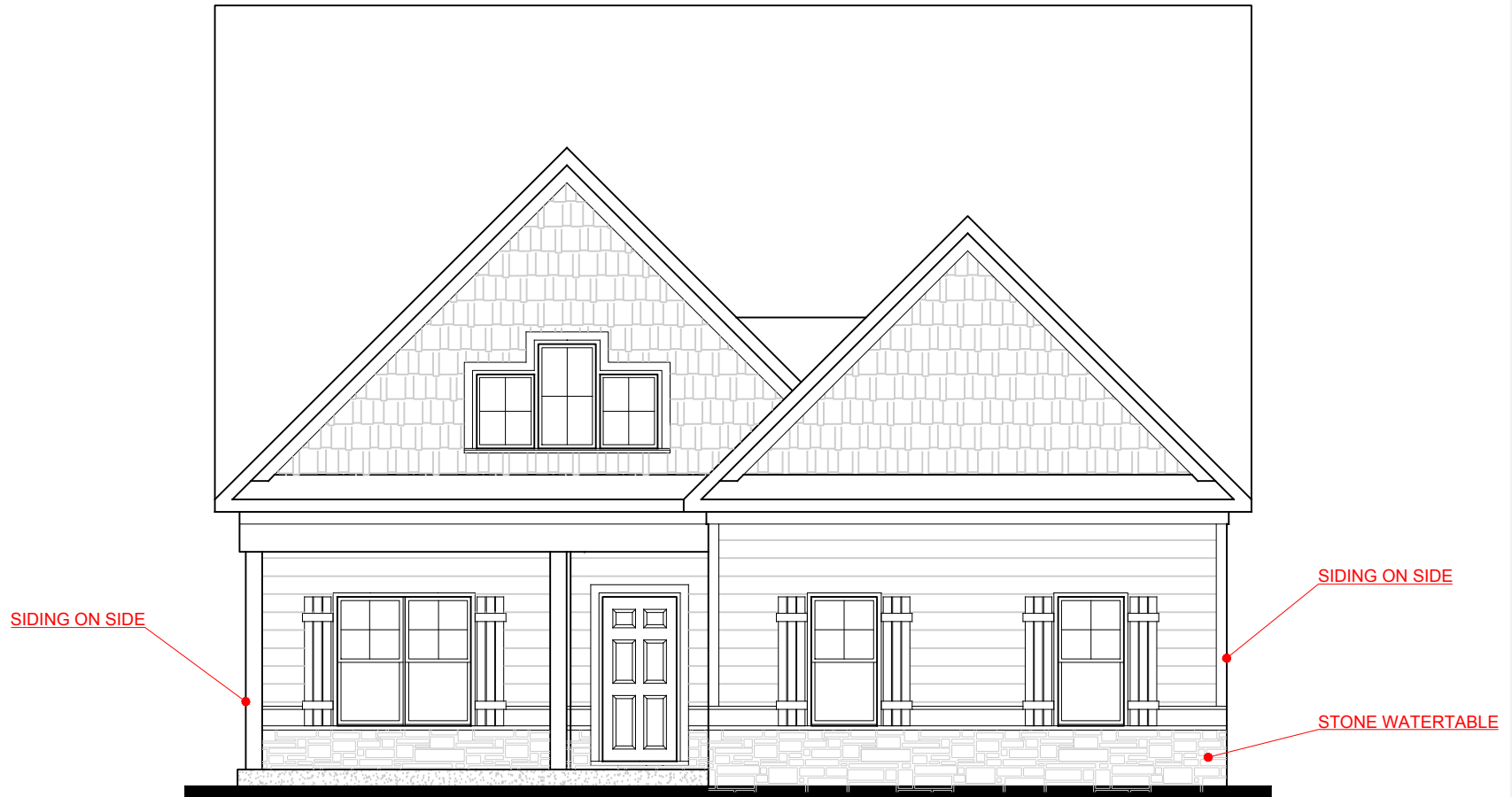
FRONT ELEVATION- B VERSION