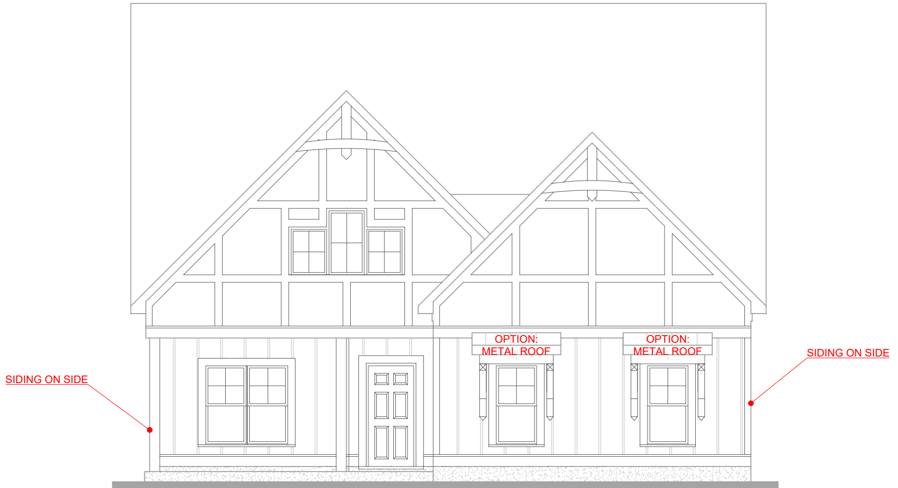
FRONT ELEVATION- A VERSION