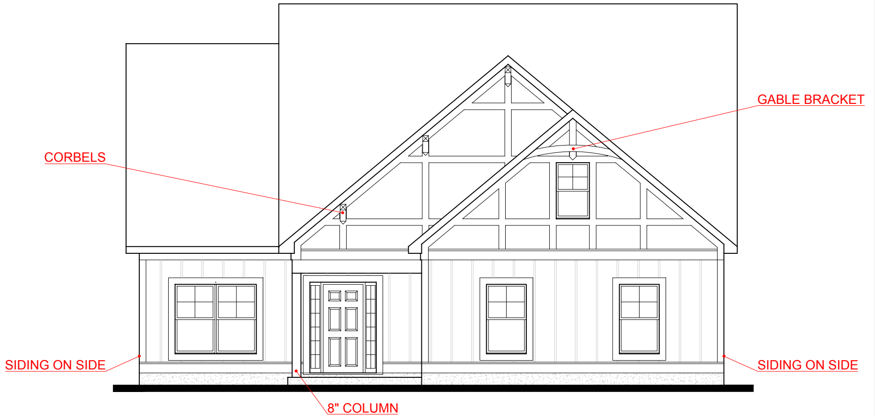
FRONT ELEVATION - A VERSION