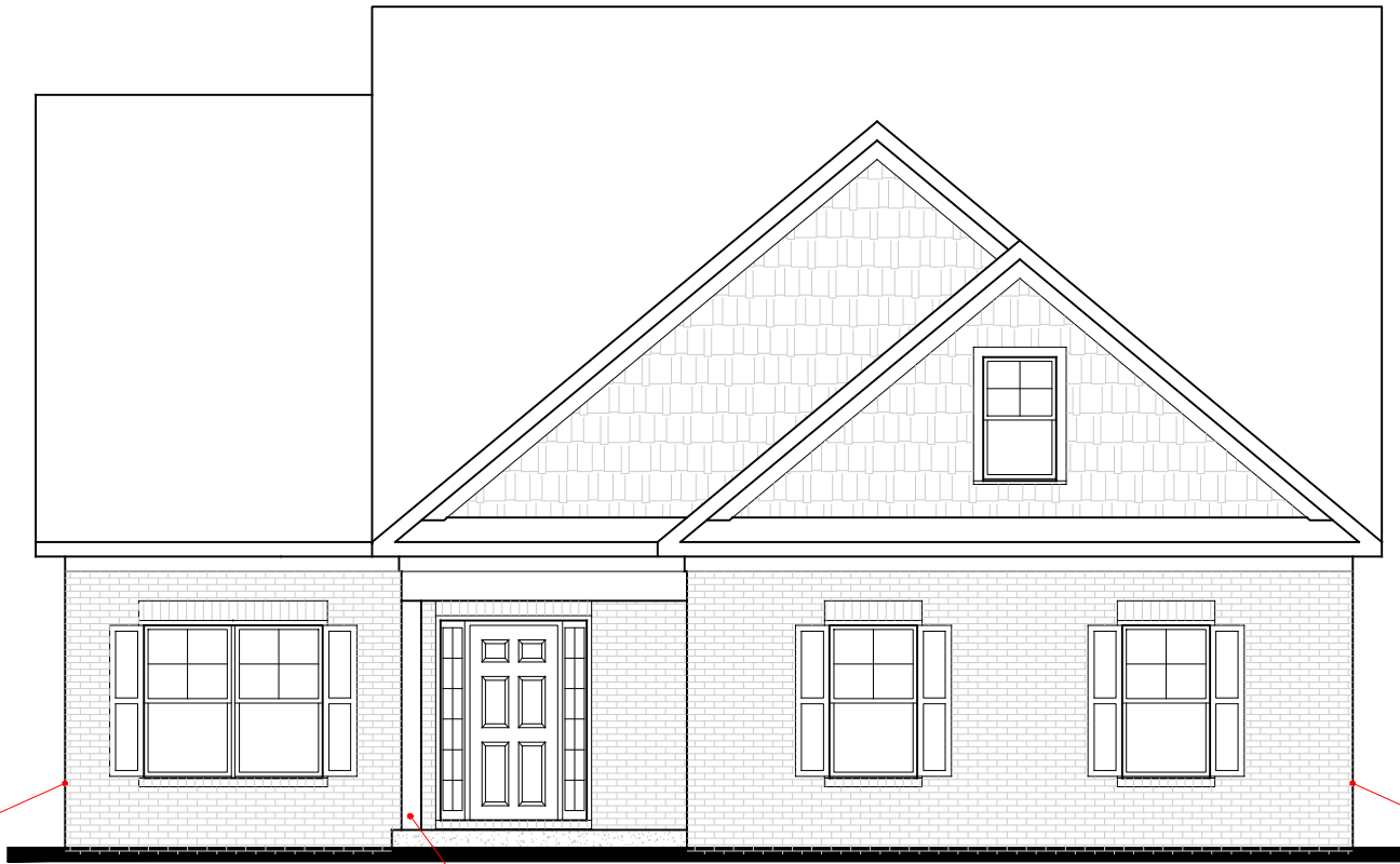
FRONT ELEVATION - D VERSION