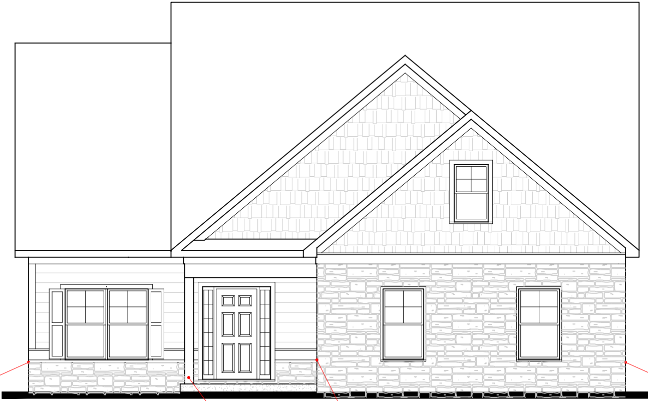
8" COLUMN SIDING ON SIDE FRONT ELEVATION - B VERSION