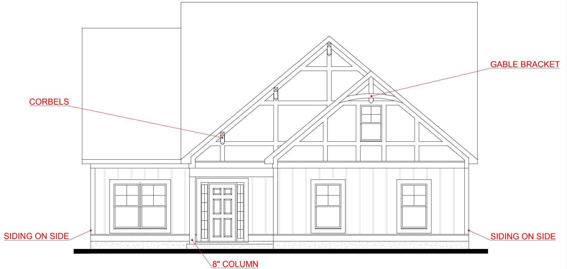
FRONT ELEVATION - A VERSION