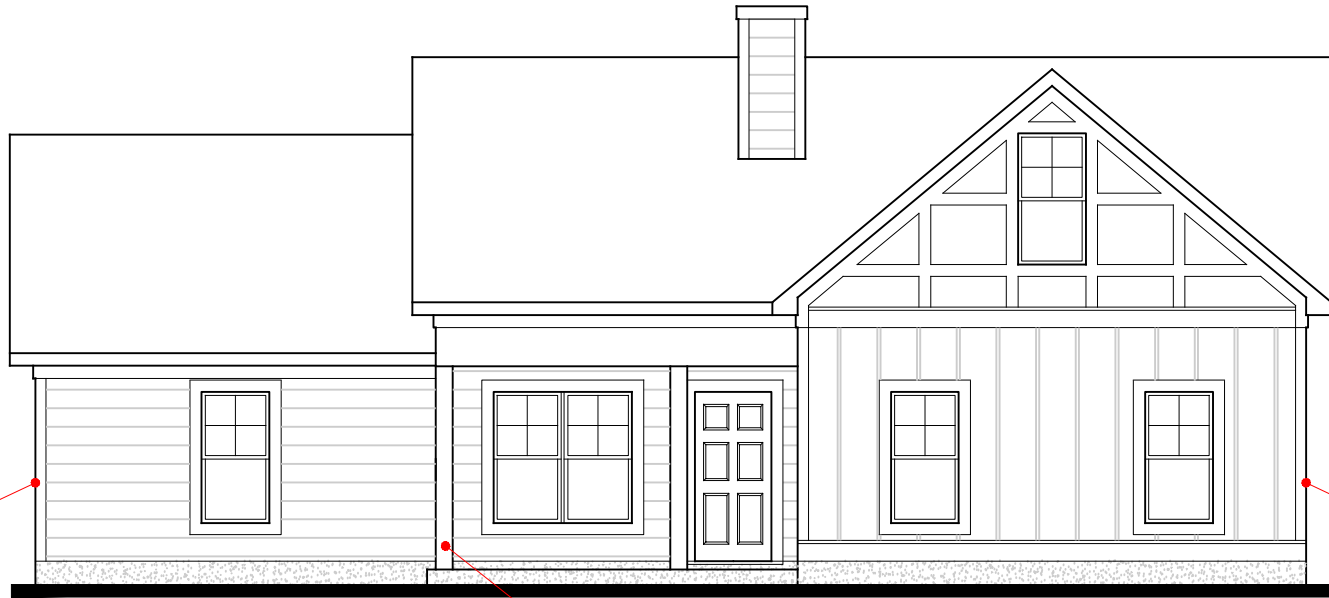
FRONT ELEVATION- A VERSION