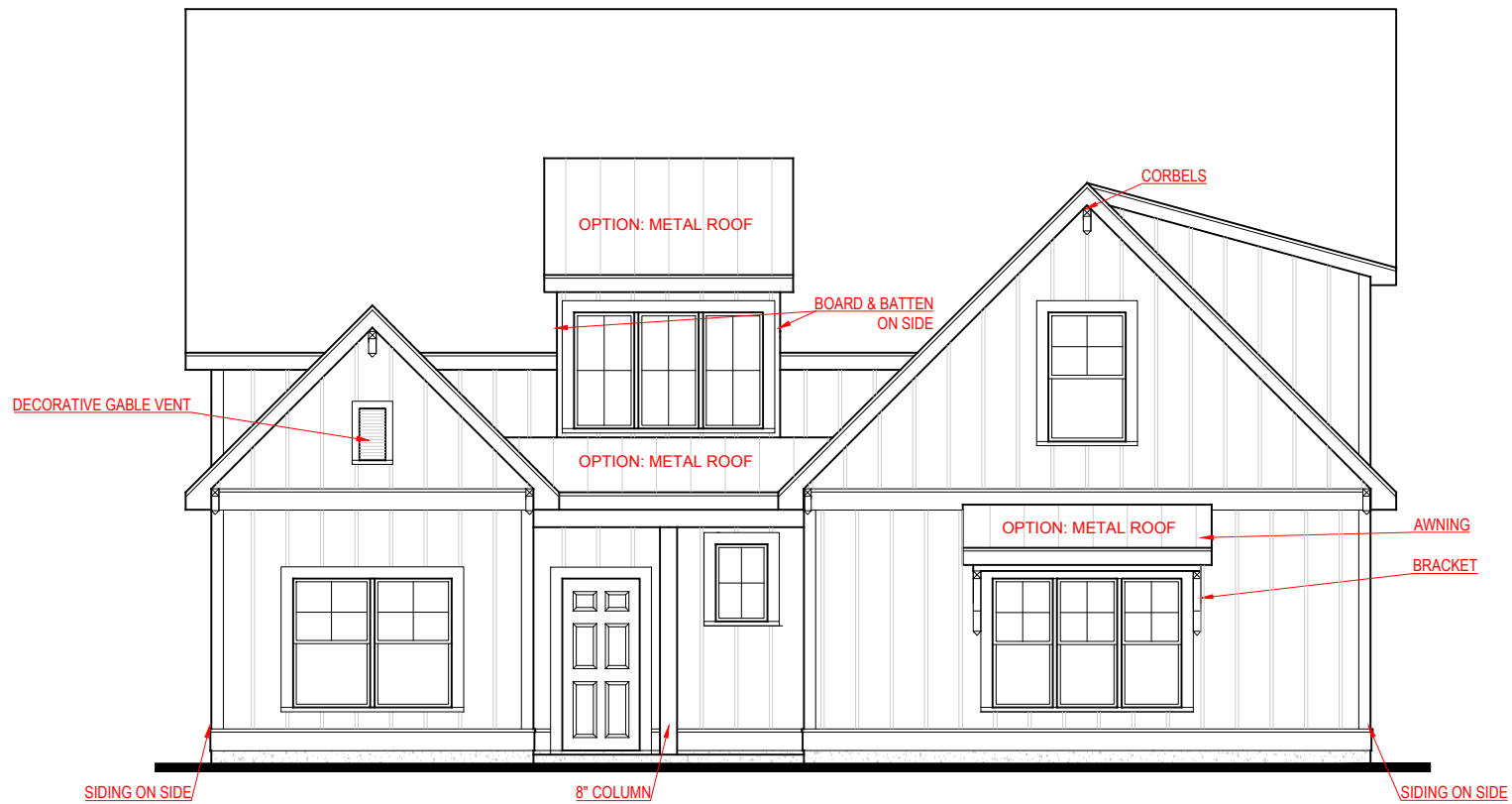
FRONT ELEVATION - A VERSION