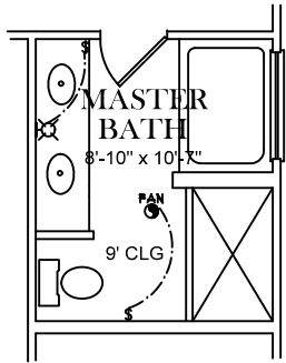
ALT. BATH OPTION