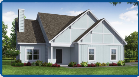
FREEMAN A 5 BED